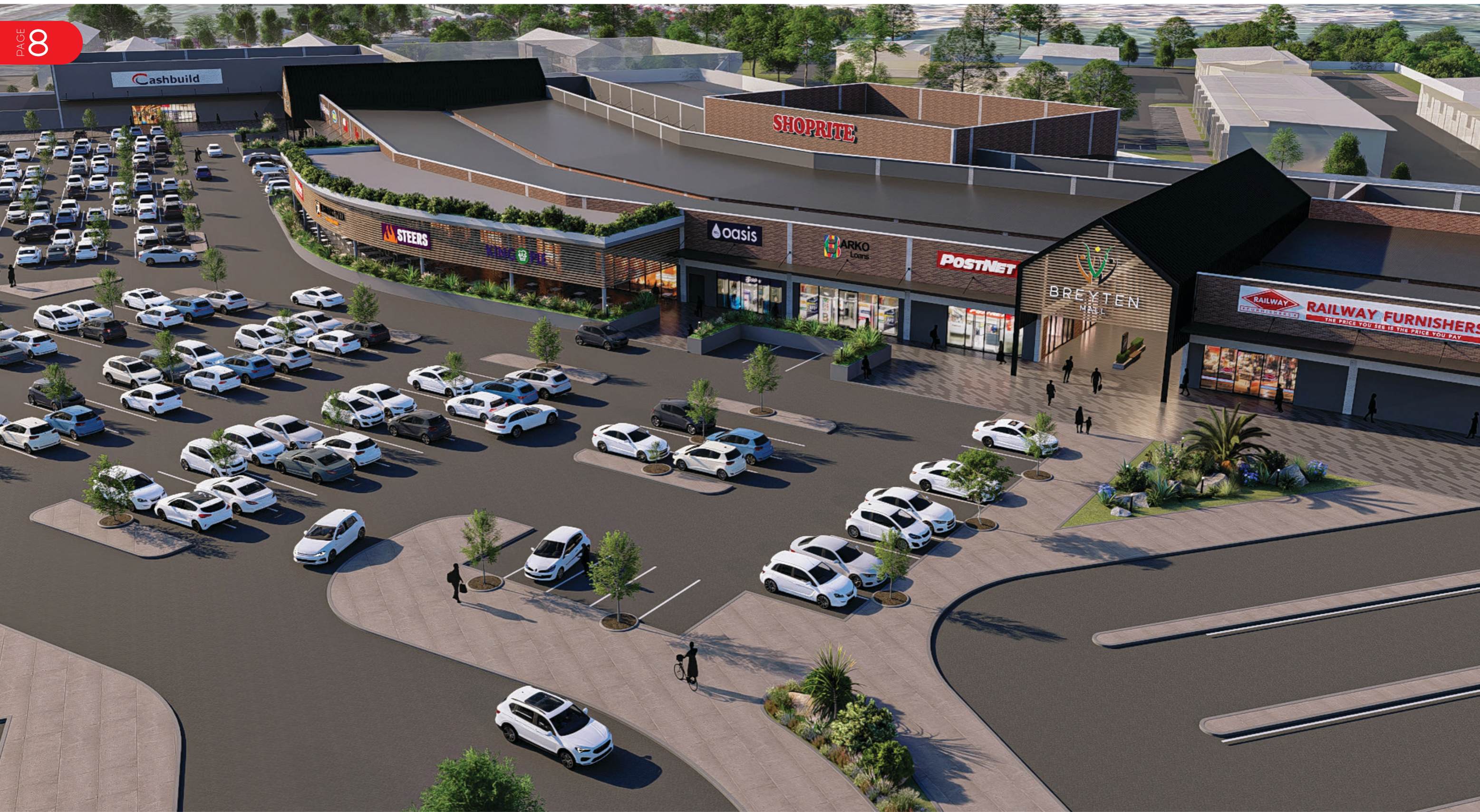
RETAIL VIEW 04