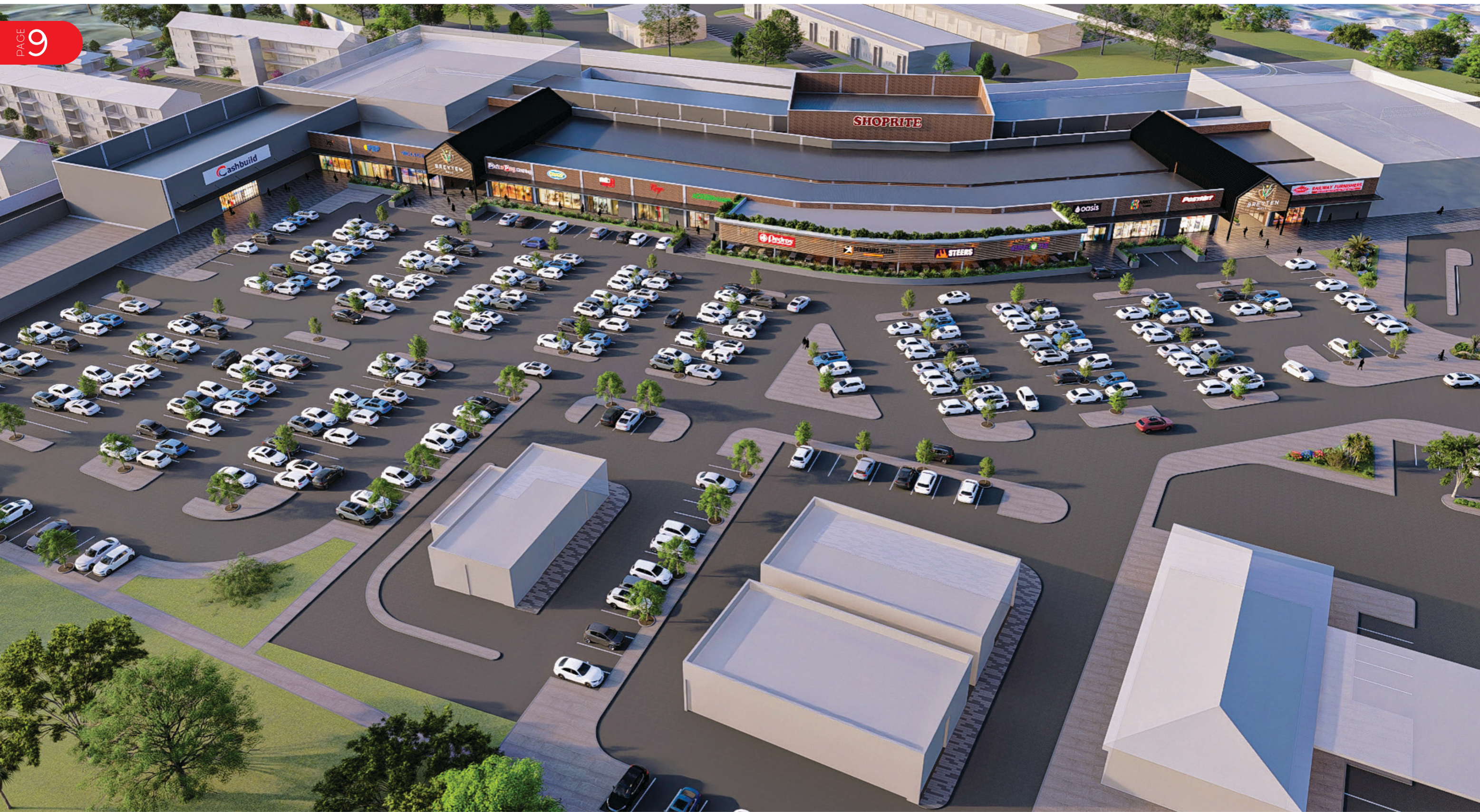
RETAIL VIEW 05