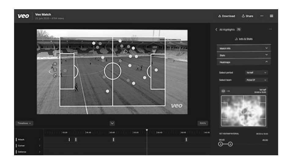
VEO 2: Individual Breakdown