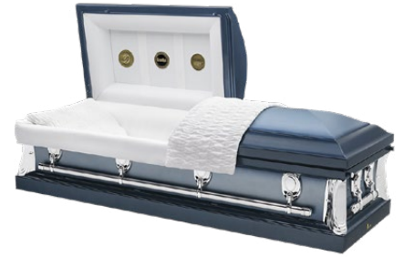
Ocean Blue: $3,095