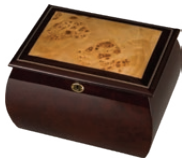
Mahogany Burl Treasure Chest (SS 704MBT)