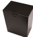
Plastic Temporary Urn (C 33-060)