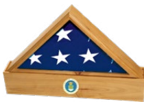
Classic Flag Case and Urn (SS 707Oak)