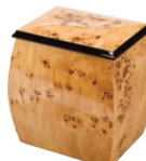
Oblique Treasure Chest (SS 704OT)