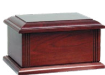
The Tradition Hardwood Urn (C 30-H-200)