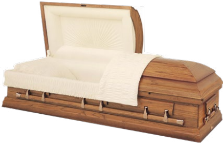
Autumn Oak: $4,945

(Additional casket selections are available at our funeral home)