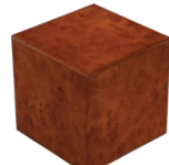
Burlwood Cube (SS 704BC)