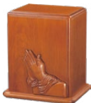
Praying Hands (SS 702PH)