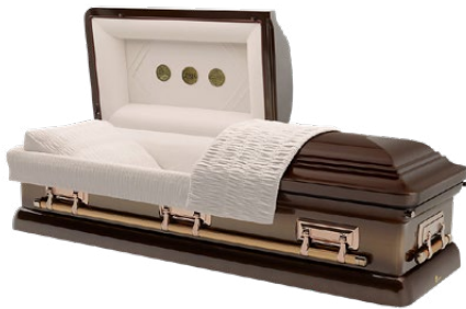
Auburn Sunset: $3,695