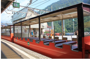
Kurobe Gorge Trolley Train

9:42-11:41a.m. We will take KUROBE GORGE TROLLEY TRAIN that runs along the Kurobe River from UNAZUKI STATION to NEKOMATA STATION and back to UNAZUKI STATION.