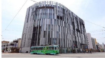
Toyama Glass Art Museum