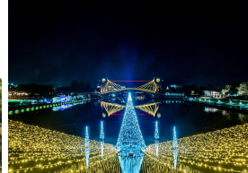
Kansui Park's Night Illumination