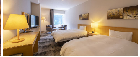
Grandvrio western style room

1:00p.m.-2:30p.m. Lunch at MICHINO EKI INAMI KIBORI no SATO SOYUKAN. If you like croquette, try the famous TAKAOKA CROQUETTE, locals favorite.