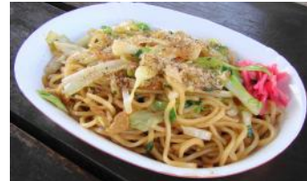
Famous Fujinomiya Yakisoba