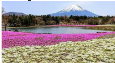
Mt Fuji Shibazakura Festival

Arrive at MT. FUJI SHIBAZAKURA FESTIVAL, one of the most popular occasions nationwide to see shibazakura (pink moss or phlox moss in English) with the background of magnificent Mt. Fuji. You will also get to enjoy local delicacies of the Mount Fuji area. Fujinomiya Yakisoba is stir-fried noodle mixed with meat, cabbage and bonito flakes to create a hearty and sumptuous meal. Mt. Fuji Delicious Foods Festival will be held in the park's restaurant and shop area, with stalls featuring delicious treats from different places around the mountain.