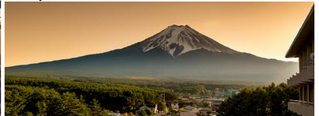
Mt Fuji from Hotel Regina Kawaguchiko

After lunch, continue on to LAKE KAWAGUCHI in YAMANASHI, for 2.5 hours ride with 2 rest stops along the way.