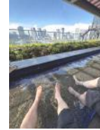
Toyosu Senkyaku Banrai & Foot Bath (Ashiyu)