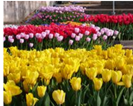
Assorted wisterias, assorted tulips seen at Ashikaga Flower Park