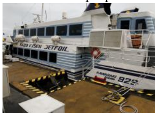
Jet Foil to Sado Island