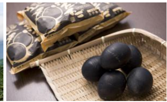
Owakudani's Black Egg