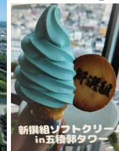
Shinsengumi Soft Ice Cream