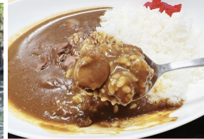
Scallop Curry Rice