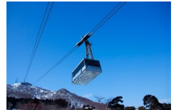
Mt. Hakodate Ropeway

4:30p.m. Return back to the hotel. The rest of the day is at your leisure. ( B )