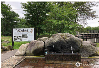
Taisetsu Asahidake Water