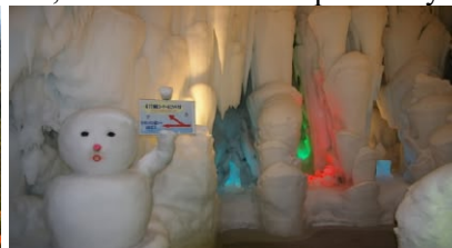
Hokkaido Ice Pavillion