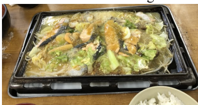
Chan Chan Yaki