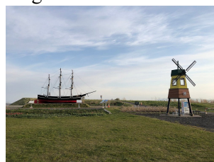
Saraki Misaki (Cape Saraki)