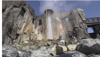
Shikabe Geyser Park

Scallop Mild Curry Rice is their specialty and Tempura Soba also very popular.