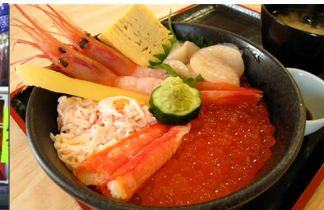
Fresh Seafood Bowl