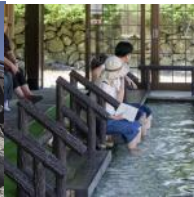
Ashiyu (Foot Onsen)