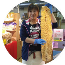
Hakodate Morning Market

8:45a.m. Walk to famous Hakodate Asaichi (morning market). At the market, you will see lots of various seafoods, konbu & nori, and fresh fruits. We recommend the shoyu butter sauté scallops (vacuum packed individually and the giant ika seen below) from Aoyama Suisan. Free shopping and lunch on our own at the morning market.