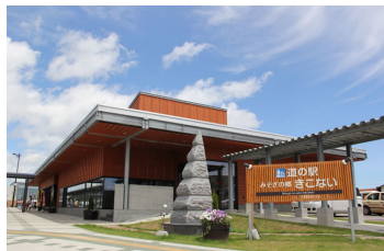
Michino Eki ‘Misogi no Sato Kikonai