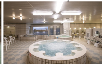
Onsen Spa at Art Hotel Asahikawa