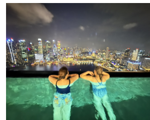
Infinity Pool at Marina Bay Sands Hotel

Visit MERLION PARK, a famous Singapore landmark and a major tourist attraction.