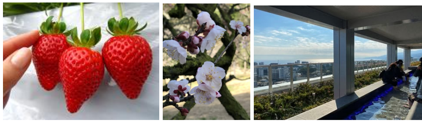
Ashiyu on the 14 th Floor

3:45p.m. Arrive at TENSEIAN ODAWARA EKI BEKKAN HOTEL(4 star hotel) directly connected to Odawara Station. After check-in, relax and enjoy the rest of the day. Enjoy natural hot spring on the 10 th floor and ashiyu"foot onsen" on the 14 th floor. 10 & 13 th Floor is microwave, vending machine, and ice machine 11 th floor is coin laundry facility (please bring your own detergent & fabric softener) The hotel is inside the MINAKA ODAWARA with its Edo atmosphere, which is divided into two towers, home to a variety of food and beverage stores. The "Seisho Food Stadium" features a variety of popular local restaurants from the Odawara and Seisho areas. Places to eat: 2 nd floor: TONKATSU WABUTA & UNGAI KYOYA 3 RD floor: KAITEN SUSHI HOJO, ODAWARA CHAMPON, NIHACHI SOBA SHOAN(buckwheat) LUSCA ODAWARA (shopping mall) connected to JR ODAWARA STATION, 1 ST floor: KURIKOAN (TAIYAKI), BAKERY POMPADOUR, KYOTARU SUSHI, TAGONOTSUKI (WAGASHI) famous for Mochi Manju, Monaka with Mochi, & etc. Lots of SWEET SHOPS. 2 nd floor: MARUKAME (Udon, Katsudon, & Tonteki (Pork Steak) & TAKOYAKI GINDACO 3 RD floor: DOUTOUR COFFEE SHOP (Sandwiches & Desserts), TRE TATTE (Italian Café & Pasta)