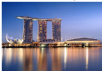
Marina Bay Sands Hotel