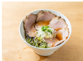
Maguro no Doukoi Meshi