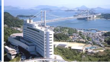
Kurashiki Setouchi Kojima Hotel