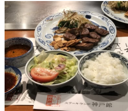
Kobe Beef Teppanyaki