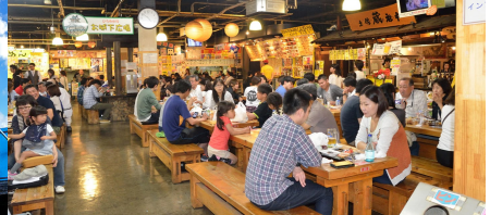
Sunday Morning Market