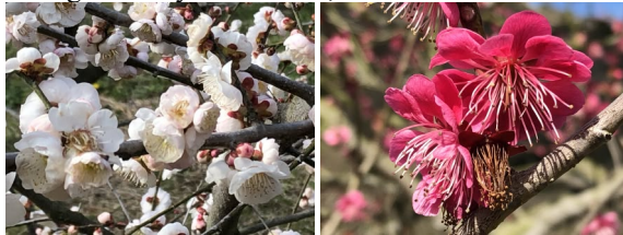
Ume Flowers taken on March 2024

First stop, RITSURIN PARK, one of the most famous gardens created by the local feudal lords during the early Edo Period, considered one of the best gardens in Japan.