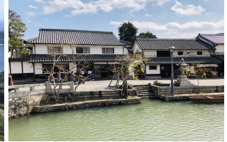
Kurashiki Historical Area

We will make couple 5-4-4- stops at the service area on the toll way.