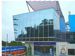
Sakamoto Ryoma Statue