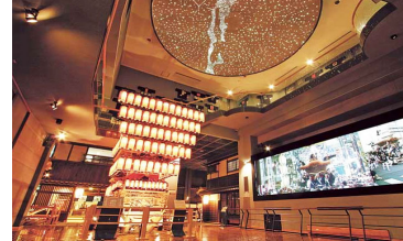
Kishiwada Danjiri Kaikan

After Himeji, continue on to KOBE (HYOGO). Kobe is the sixth-largest city in Japan and the capital city of Hyogo Prefecture.