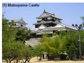
(1) Matsuyama Castle

7:00a.m.(starts) Breakfast at the hotel. 9:00a.m. A day tour of MATSUYAMA CITY. 9:30a.m. First stop, Matsuyama Castle , one of Japan's twelve "original castles", which have survived the post-feudal era since 1868 intact. It is also one of the most complex and interesting castles in the country. It is located on Mount Katsuyama, a steep hill in the city center that provides visitors with a bird's eye view of Matsuyama and the Seto Inland Sea.