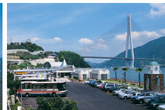
Imabari Towel Museum