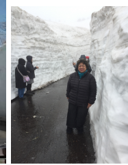
Mt. Hakkoda's Snow Wall

After the tour, check-in 1 night at DAIWA ROYNET AOMORI in downtown Aomori City.