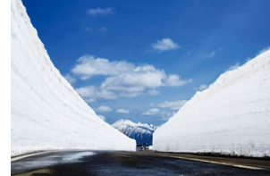
Hachimantai Aspite Line-Snow Corridor

For lunch, we will have a local favorite, ‘WANKO SOBA’ (buckwheat noodles soba) served up as a lively eating contest. This local favorite began almost four centuries ago as an efficient way to provide guests with “all-you-can-eat” noodles, and continues today as one of Iwate’s most famous food experiences.