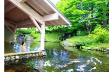
Takakura Outdoor Onsen

En route to TAKAKURA ONSEN, we will make 1 stop in MORIOKA CITY’S ISHIWARI SAKURA, there is a large granite boulder 21 meters in circumference in the garden in front of the Morioka District Court. The 360 year-old Edohigan cherry tree that grew out of a crack in the boulder has been designated as a national natural treasure in 1923. The Morioka District Court was built on the site where the house of the Nanbu domain lords' branch family used to be.