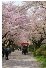
Kitakami Tenshochi Park Ishiwari Sakura