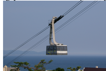
Shikabe Geyser Park Ashiyu ( Foot Onsen) Hakodate Ropeway to Mt. Hakodate

On our way back to HAKODATE, drive to MOTOMACHI, unique western-influenced buildings, more than a century old, and traditional Japanese buildings still remain in the city to this day.