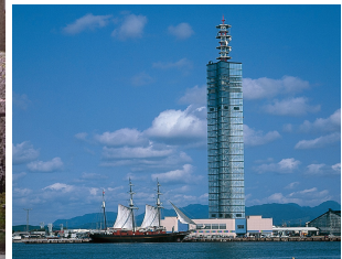
Akita Port Tower Selion

AKITA PORT TOWER SELION, the symbol of Akita Port. Here you can enjoy a 360-degree panorama view from 100 meters above. On the first floor of the Selion, you will find fresh pickled vegetables and specialty products of Akita for sale. You can also sample local sakes.