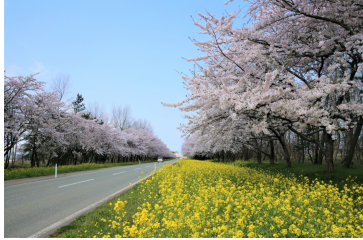
Sakura Nanohana Road