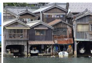
Ine Fishing Village