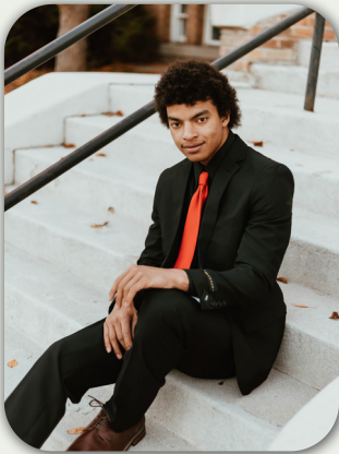
Isaiah Crayton Van Pullen Scholarship