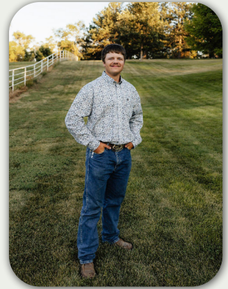
Reese Gillespie Ellis and Lola Hanthorn Scholarship