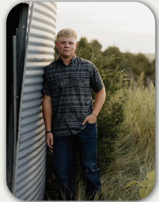
Cole Walter Youth Advisory Board Scholarship