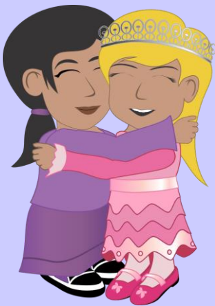
Boastful Betty & Princess Penny

Perseverance Resilience Gratitude Reflection Honesty Kindness Compassion Self-Esteem