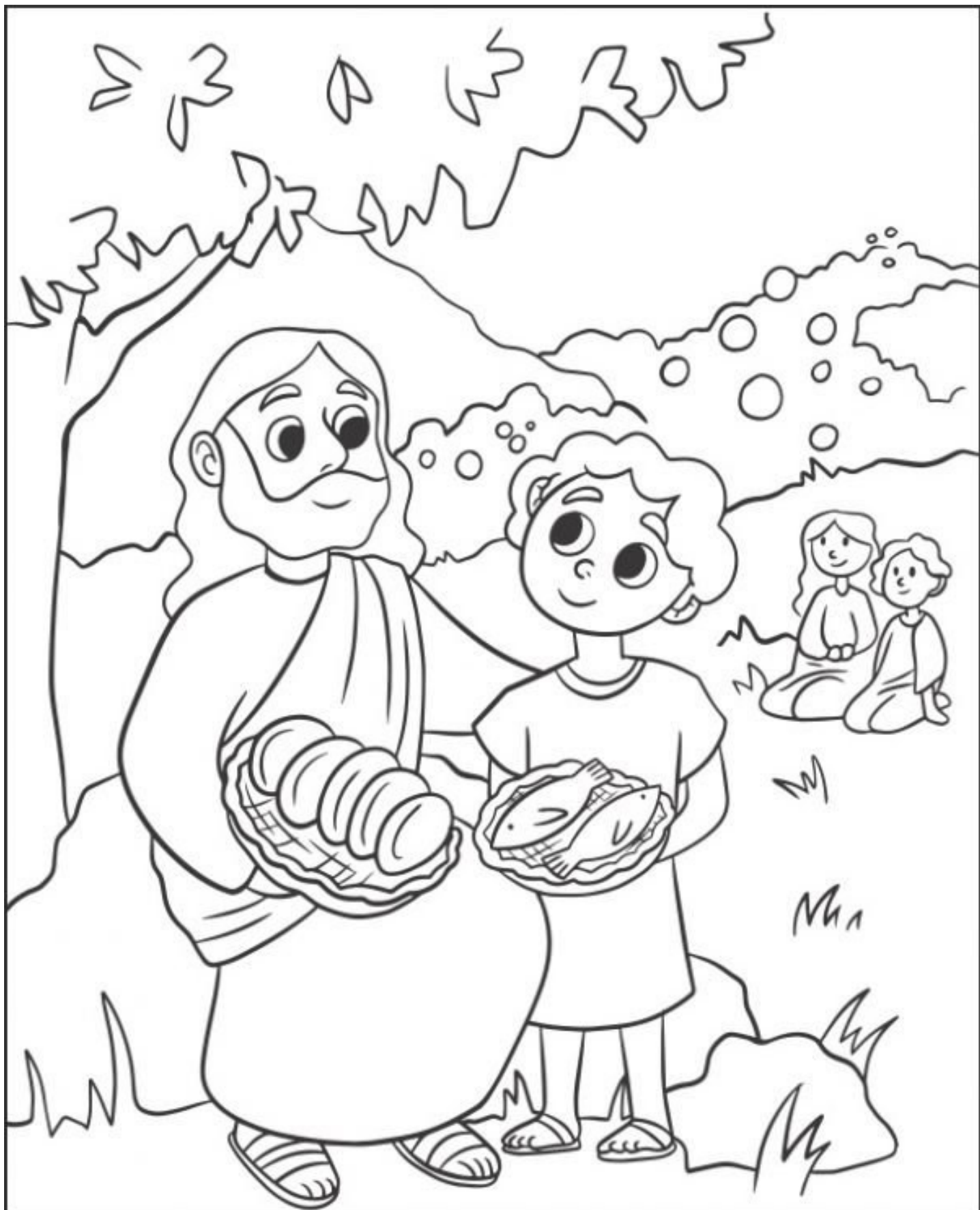
The Multiplications of the Loaves & Fishes