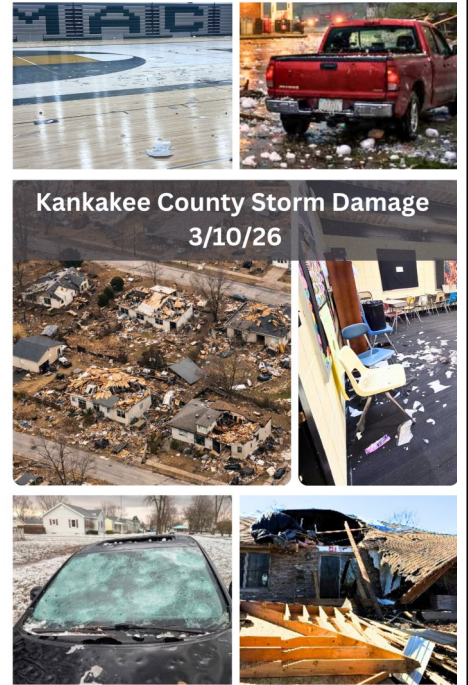
Kankakee County Storm Damage 3/10/26