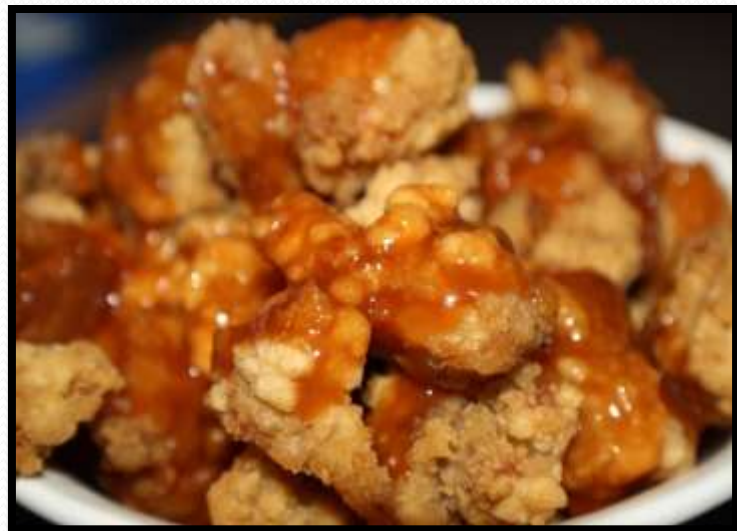
POPCORN CHICKEN WITH SWEET & SOUR