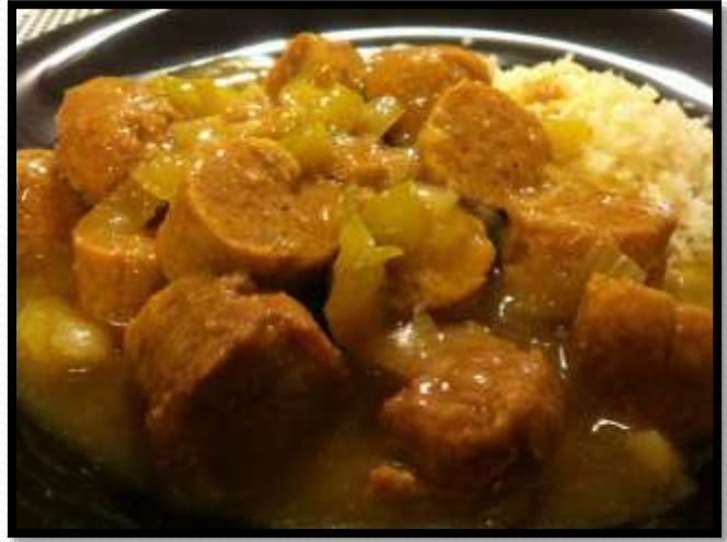
CURRIED SAUSAGES AND RICE