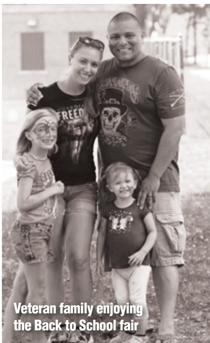
Veteran family enjoying the Back to School fair