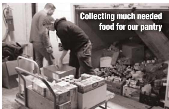
Collecting much needed food for our pantry