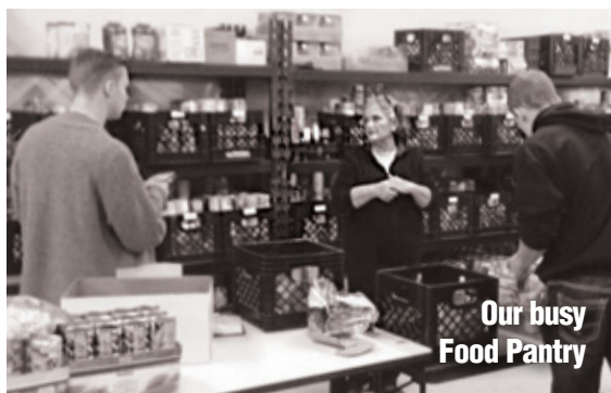
Our busy Food Pantry