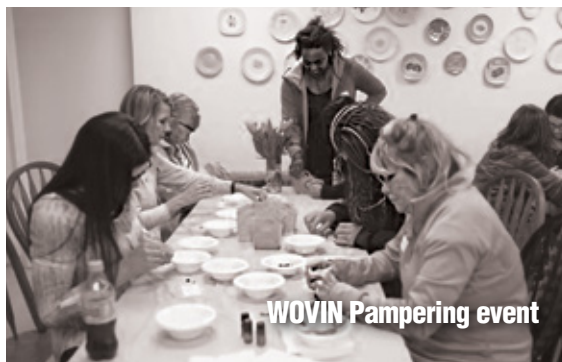
WOVIN Pampering event