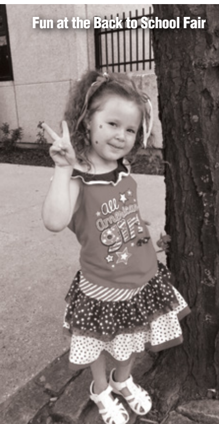
Fun at the Back to School Fair