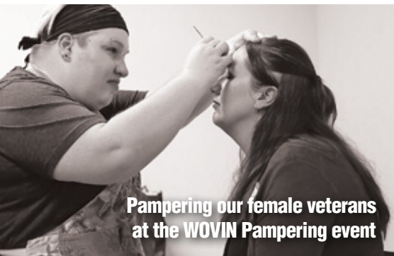
Pampering our female veterans at the WOVIN Pampering event

6300 W. National Avenue West Allis, WI 53214 414-257-4111