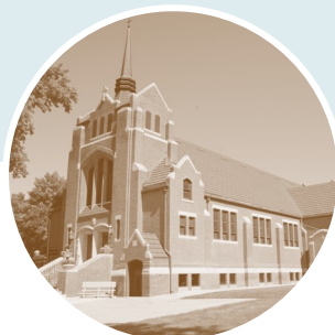
ST. THOMAS AQUINAS Catholic Parish De Smet, SD