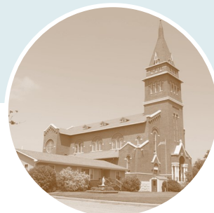
SAINT WILFRID Catholic Parish Woonsocket, SD