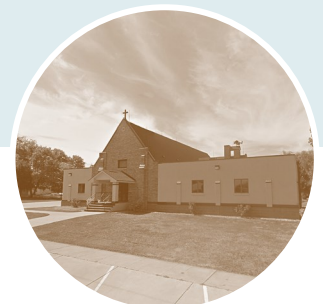
SAINT JOSEPH Catholic Parish Wessington Springs, SD