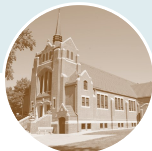
ST. THOMAS AQUINAS Catholic Parish De Smet, SD