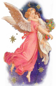
And He Will Raise You Up On Eagle's Wings...

For those who have suffered the loss of a child of any age through miscarriage, still-birth, abortion, SIDS, illness, overdose, suicide, disease or any untimely death.