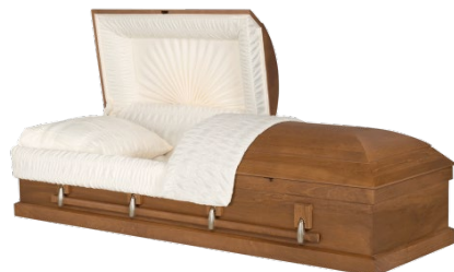
Ashford - Poplar Veneer Satin Medium Walnut Finish Rosetan Crepe Interior - $3,295