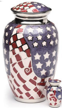
Stars and Squares $195