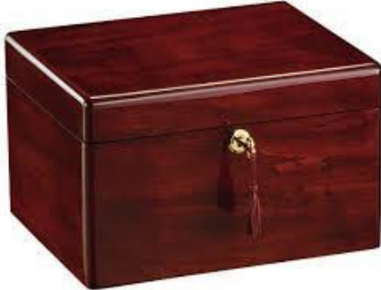
Devotion Chest $375