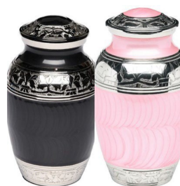
Child 7.25" x 5" $95