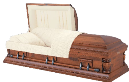
Clearwood - Maple Satin Light Colonial Finish, Rosetan Crepe Interior - $5,495