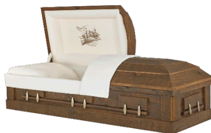
American Barnwood - Oak Satin Timber Finish, Natural Cotton Interior - $4,695