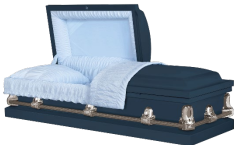
Bradford - 20ga Steel, NON-GASKETED - $2,295

Spruce Blue Finish with Blue Crepe Interior Black Finish with White Crepe Interior Copper Finish with Rosetan Crepe Interior White Finish with White Crepe Interior White Finish with Pink Crepe Interior Orchid Finish with Pink Crepe Interior Silver Finish with White Crepe Interior