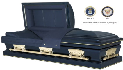
Patriot-18ga Steel – Ebony Finish with Ebony Cotton Twill Interior Freedom-18ga. Steel -Navy Finish with Navy Interior - $4,095