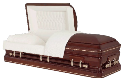
Senator - Cherry Polished Cherry tone with gold inlay, Ivory Velvet Interior - $8,395

About Our Wood Caskets... compares to the rich, warm glow of well-crafted hardwood. From the elegance of solid hardwood to the simplicity of hardwood veneer, this assortment from Grace Gardens Funeral Home shows a variety of woods and finishes that cater to all tastes and prices.