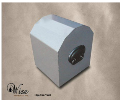
Wise 12 gauge Urn Vault - $525 Polymer Urn Vault (not pictured)- $275