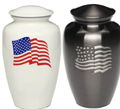
Classic or Slate Flag $125