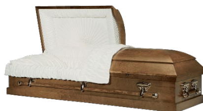
Prince - Poplar Veneer Light Satin Finish Rosetan Crepe Interior - $2,995