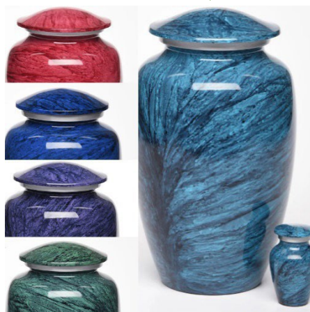
Jewel Marbled $125