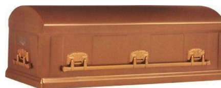
12 gauge steel Clark standard vault - $1,995 Coppertone, silvertone, or white