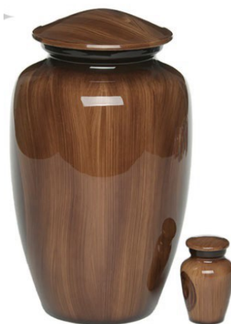
Wood Grain $125