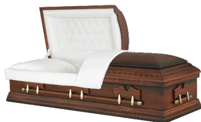
Fredrick - Poplar Satin Golden Ginger/Shaded Finish, Ivory Basketweave Interior - $4,395