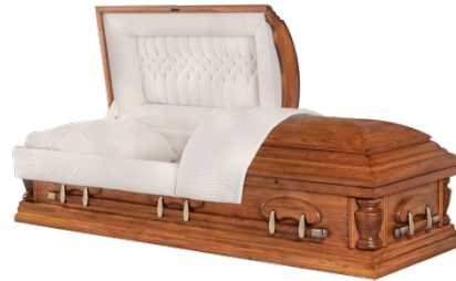
Southern/Sovereign - Pecan Satin Finish, Ivory Majestic Velvet - $5,195