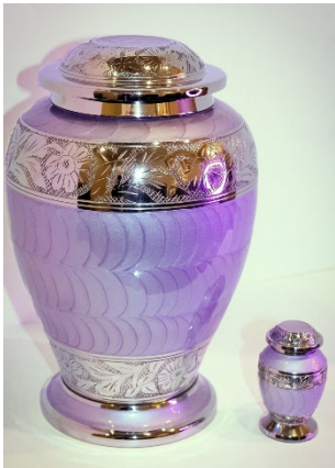
Purple Shell $275