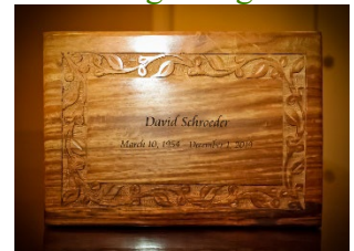
Rosewood Chest $125 With engraving $175