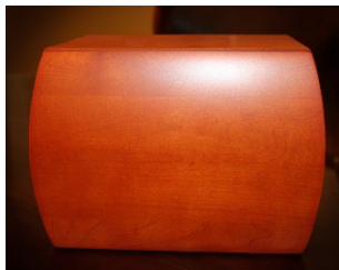
Honey Brown Chest $250