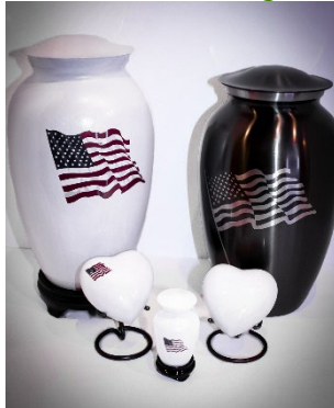
Classic or Slate Flag $250