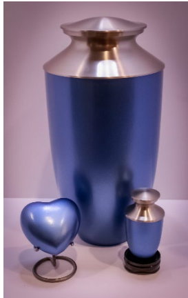
Monterey Blue $275