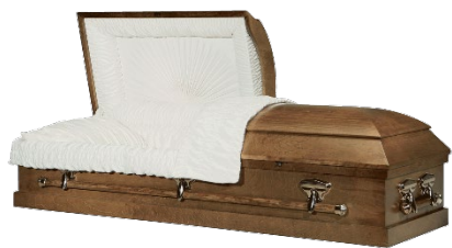
Prince - Poplar Veneer Light Satin Finish Rosetan Crepe Interior - $2,895