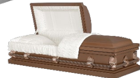
Bradford - 20ga Steel, NON-GASKETED - $2,295 Spruce Blue Finish with Blue Crepe Interior Black Finish with White Crepe Interior Copper Finish with Rosetan Crepe Interior White Finish with White Crepe Interior White Finish with Pink Crepe Interior Orchid Finish with Pink Crepe Interior Silver Finish with White Crepe Interior