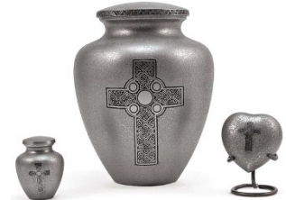
Celtic Cross $275