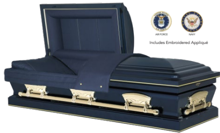
Patriot-18ga Steel – Ebony Finish with Ebony Cotton Twill Interior Freedom-18ga. Steel -Navy Finish with Navy Interior - $3,895