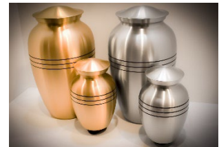
Classic Bronze or Pewter $195 child $125