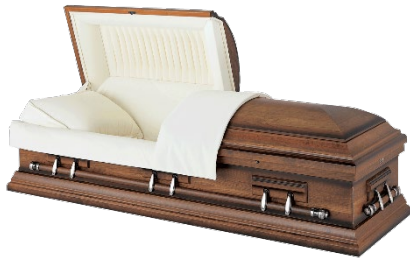
Winston - Cherry Satin Able / Shaded Finish, Arbutus Velvet Interior - $6,395

About Our Wood Caskets... compares to the rich, warm glow of well-crafted hardwood. From the elegance of solid hardwood to the simplicity of hardwood veneer, this assortment from Grace Gardens Funeral Home shows a variety of woods and finishes that cater to all tastes and prices.