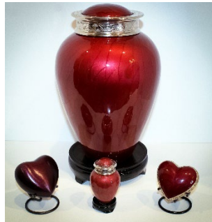
Satin Red $275