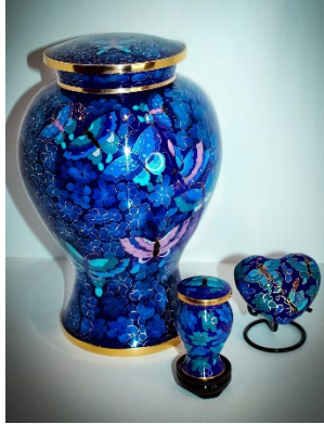
Old Glory $375