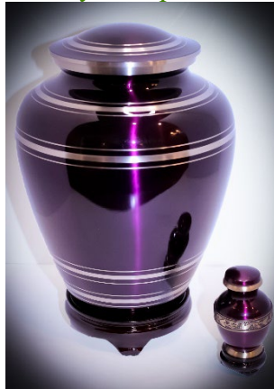
Elite Onyx/Violet $275 *Onyx not pictured