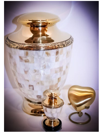
Mother of Pearl $250