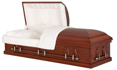
Endicott - Poplar Veneer Gloss Cambridge Finish, Rosetan Crepe Interior - $3,295