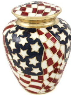
Old Glory $375