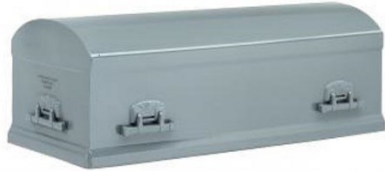
12 gauge steel Clark Economy vault – $1,595