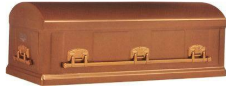
12 gauge steel Clark standard vault - $1,795 Coppertone, silvertone, or white