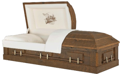
American Barnwood - Oak Satin Timber Finish, Natural Cotton Interior - $4,395