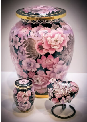
Devotion Chest $425