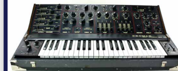
A synthesiser – an instrument that needs electricity to make sound (electronic instrument)