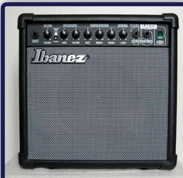
An amplifier – an electronic device used to control the volume of sound