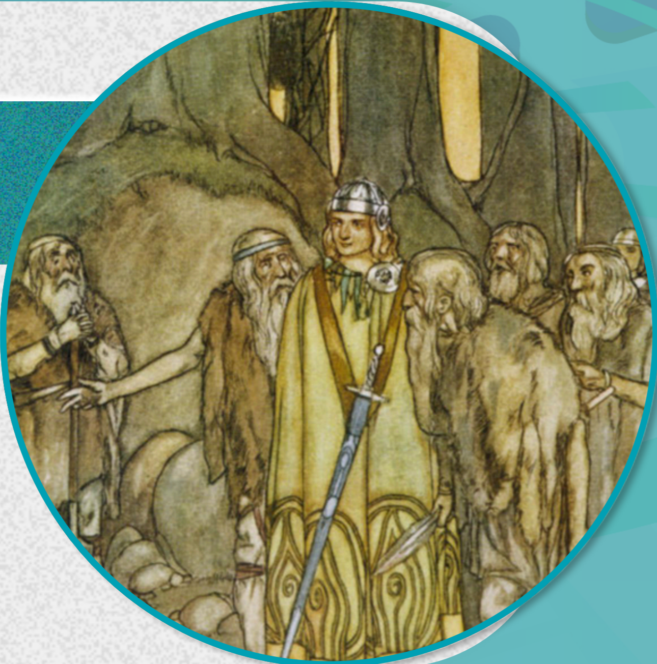
Marble Arch Caves

legend says that Finn MacCool made Lough Neagh as well as the Giant's Causeway