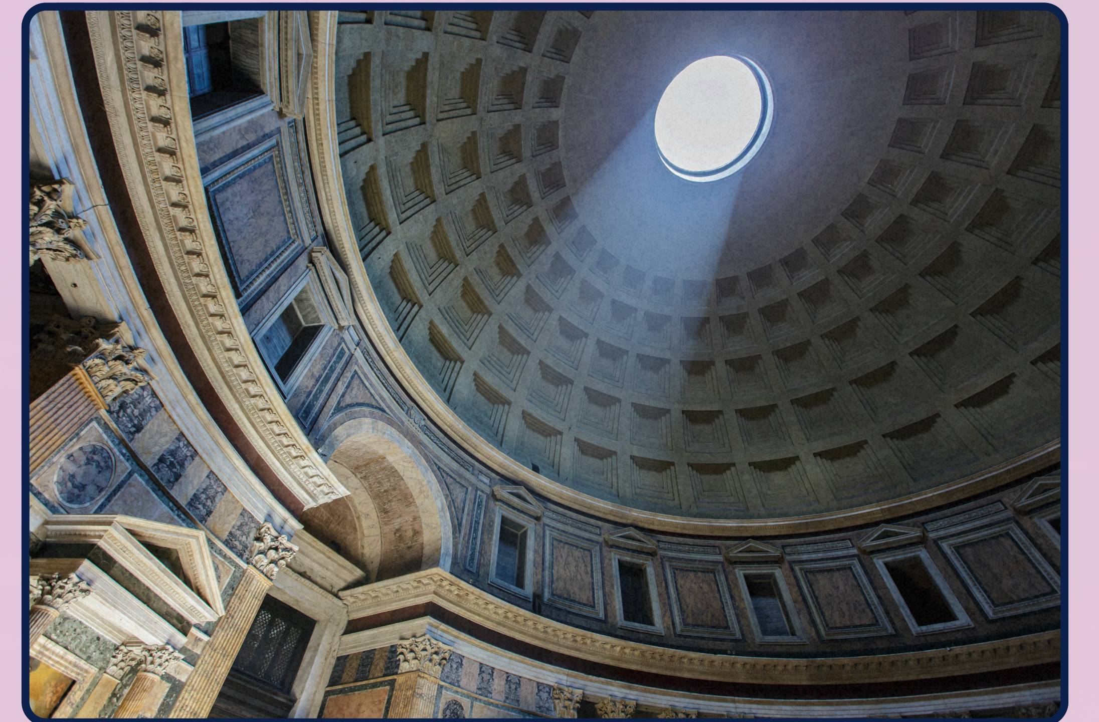
the Pantheon (126 CE)

a band of paintings or sculptures in relief