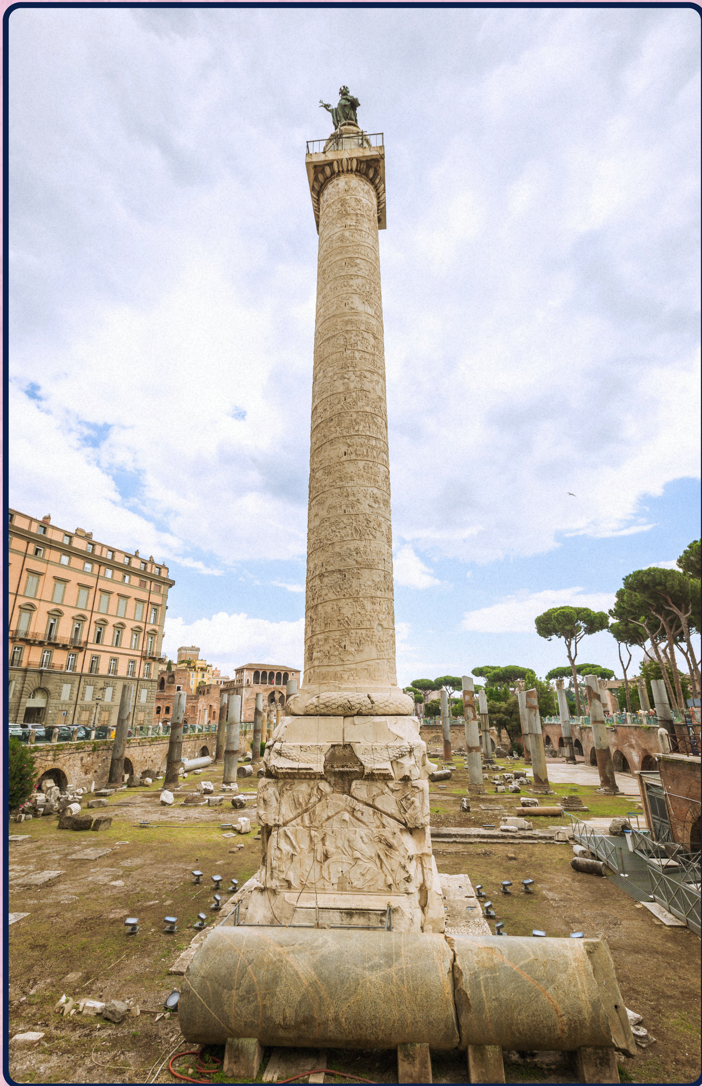
Trajan's Column (113 CE)