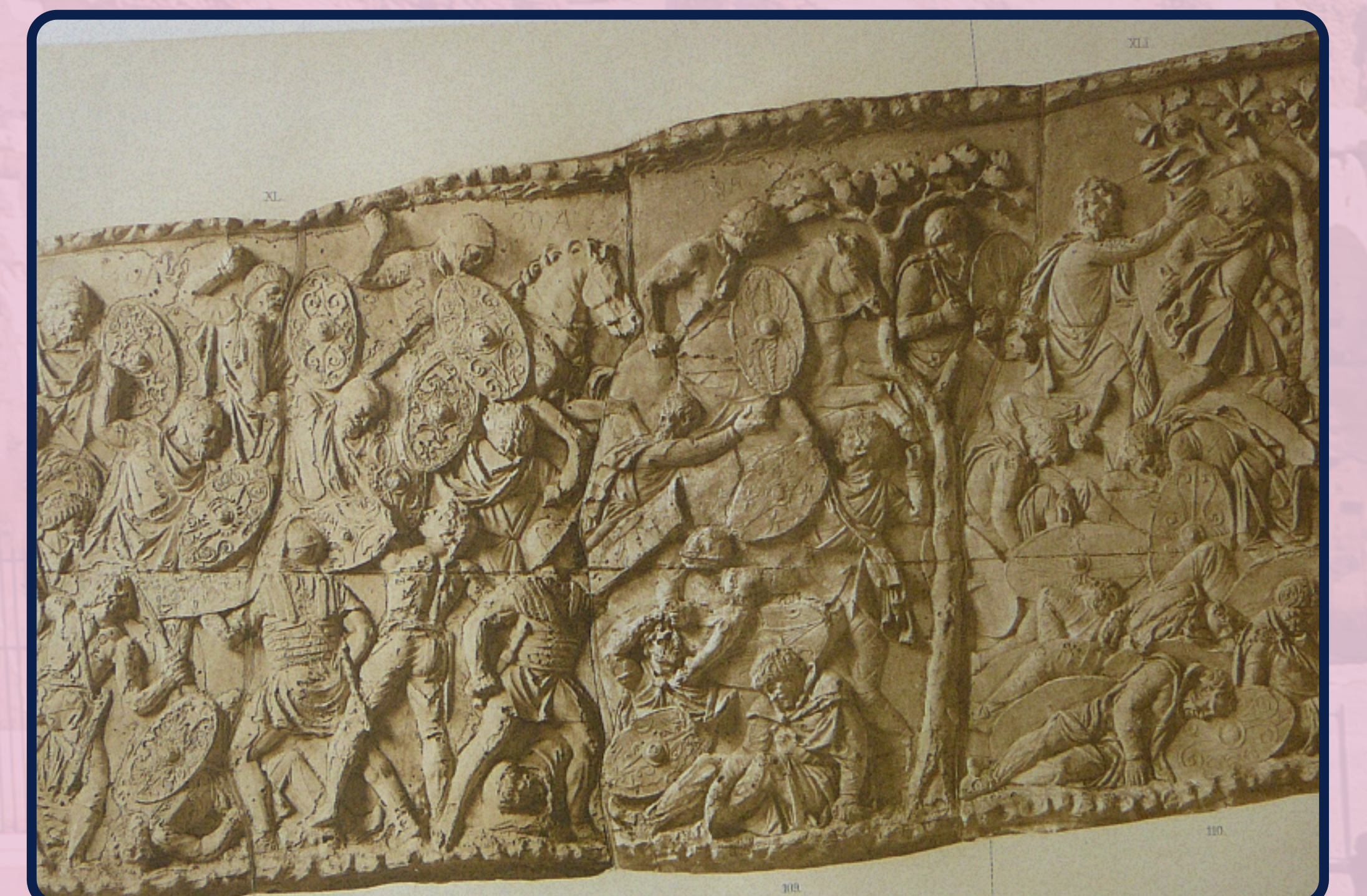
relief from Trajan's Column (113 CE) showing the Roman army