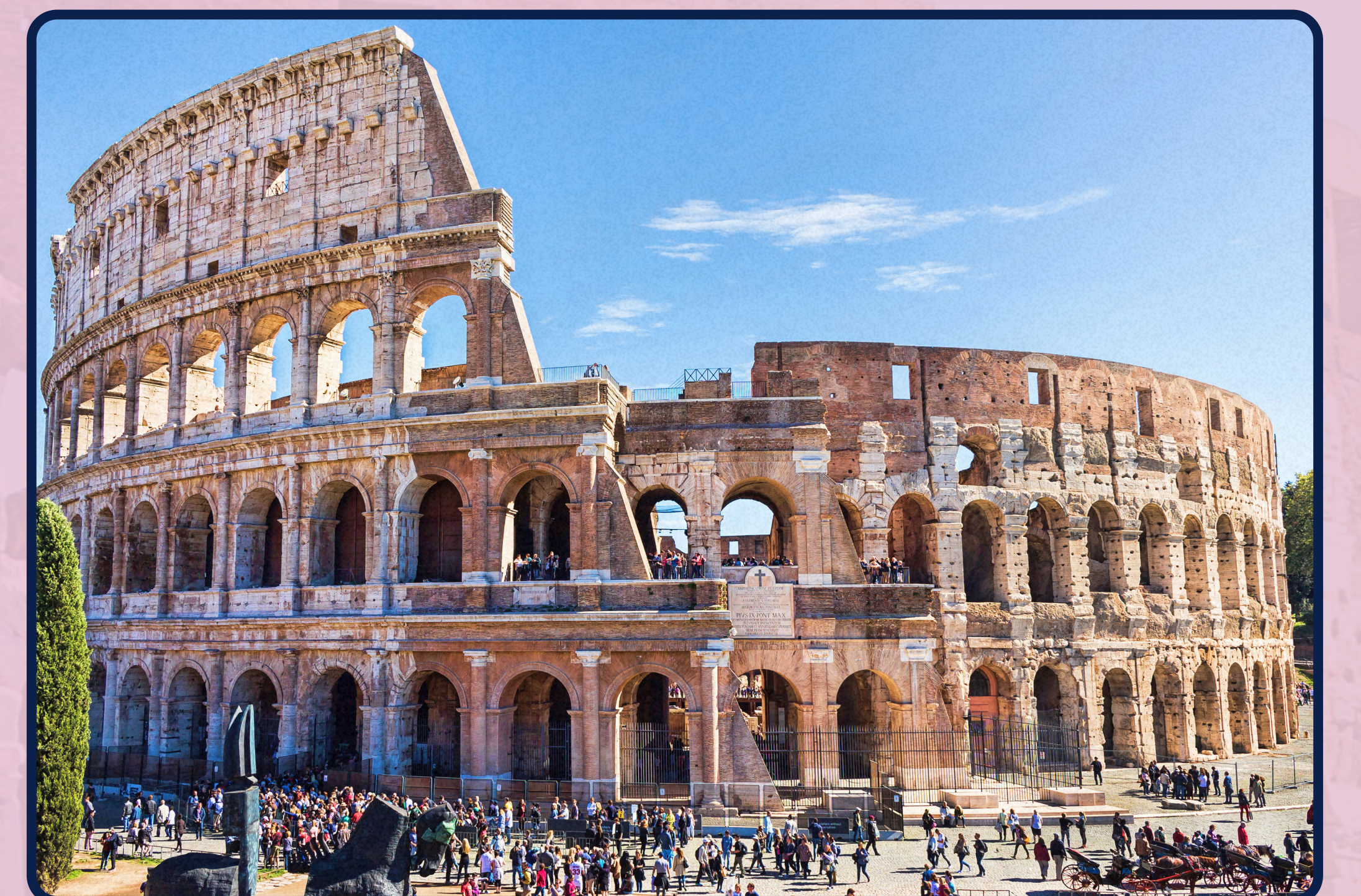
the Colosseum (80 CE)