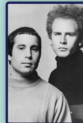
Simon and Garfunkel

People picking hops to make beer, like those described in the folk song 'Hopping Down in Kent'