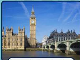
Houses of Parliament in London