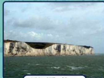
White Cliffs of Dover