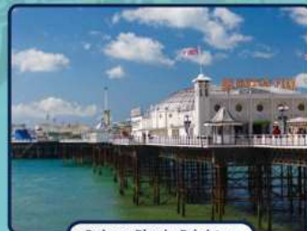
Palace Pier in Brighton