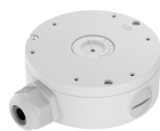
SN-CBK646M Junction Box