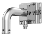
Wall Bracket (standard)