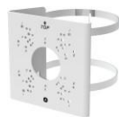
SN-CBK627D Pole Mount