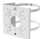
SN-CBK627D Pole Mount