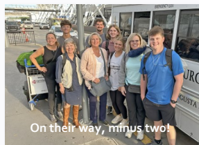
On their way, minus two!

Your Bolivia Medical Team Returned on July 28 - A Look Back