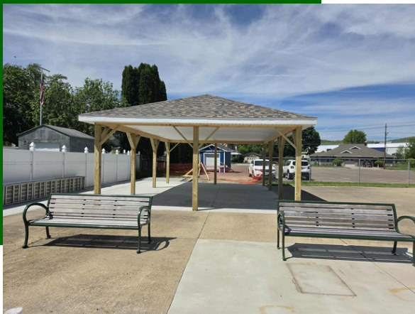
Photo: (Above): The newly built pavilion at Veterans Memorial Park. This large pavilion offers shade for visitors at the pool and will also feature several Adirondack chairs.