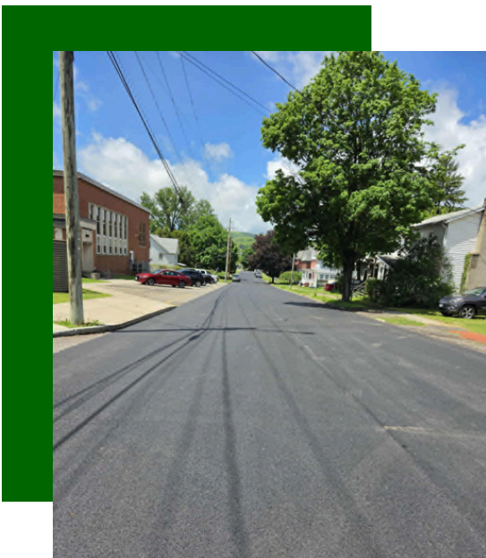
Photo (Above): The newly paved Terry Street which is one of ten streets planned for paving this year. Upcoming streets include Cameron Ave, as well as Genesee and Collier Streets, which have been highly anticipated following the completion of gas line work completed by National Fuel.