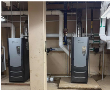
Photo (Above-left): Raw sewage pumps recently installed at the WPCP as part of Phase 1B. The project also includes new return pumps (photo above-right). This upgraded equipment handled an influent of nearly three times the average daily flow during heavy rains this spring. Finally, the photo on the bottom left illustrates the new boiler units installed.