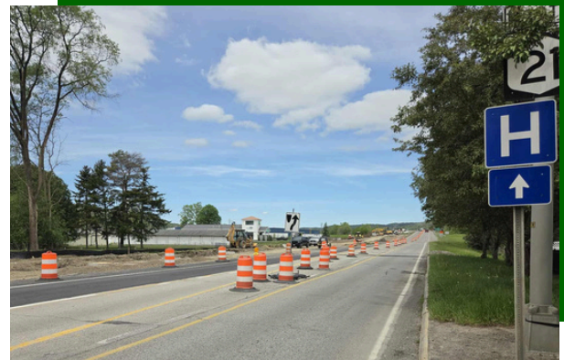
Photo (Right): Construction begins on the NYSDOT State Route 36 project from Adsit Street through Webbs Crossing, with work slated from Adsit Street through Cass Street next year. Public safety representatives offers tips for safer travel during construction.