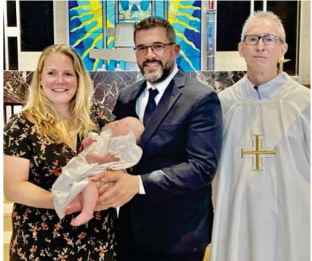
Photos from August 6/7 Indoor Masses