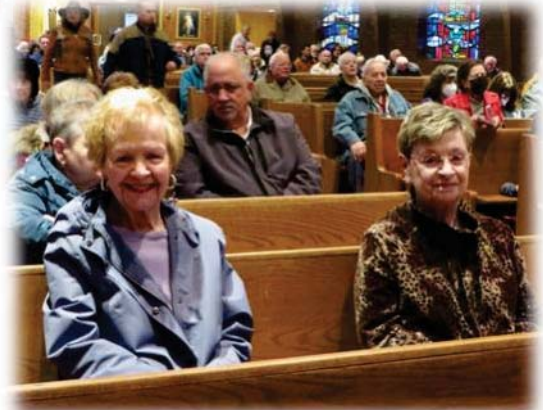
Photos from March 12-13 weekend indoor Masses