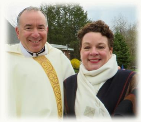
Remaining photos from our Easter Masses