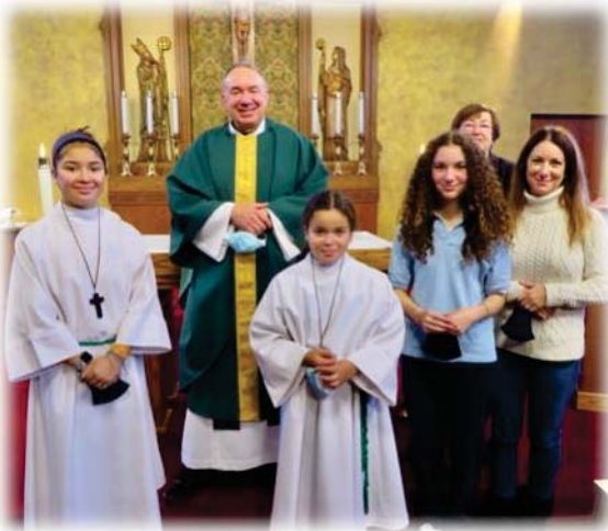
Photo to the left from the CatholicTV Mass