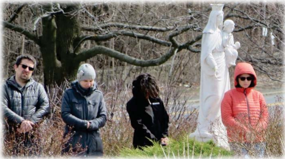
April 3, 2022 98th consecutive outdoor weekend Mass