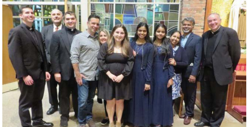
Photos from November 19/20 Weekend Masses