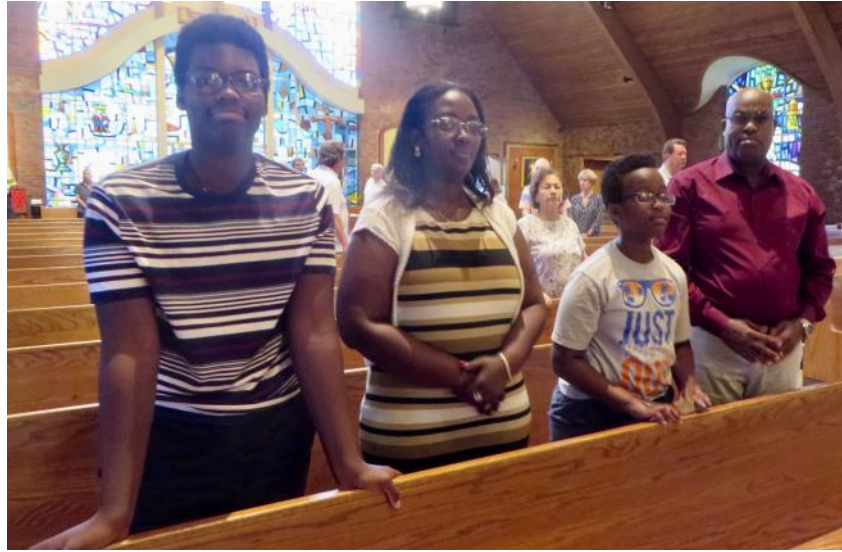
Blessing of 1st Class Relic of St. Maria Goretti at all weekend Masses July 2-3, 2022