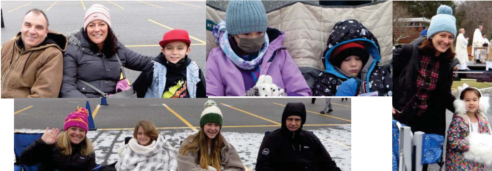
Christmas Day Mass