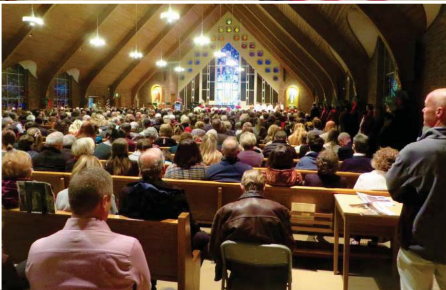
The Epiphany of the lord