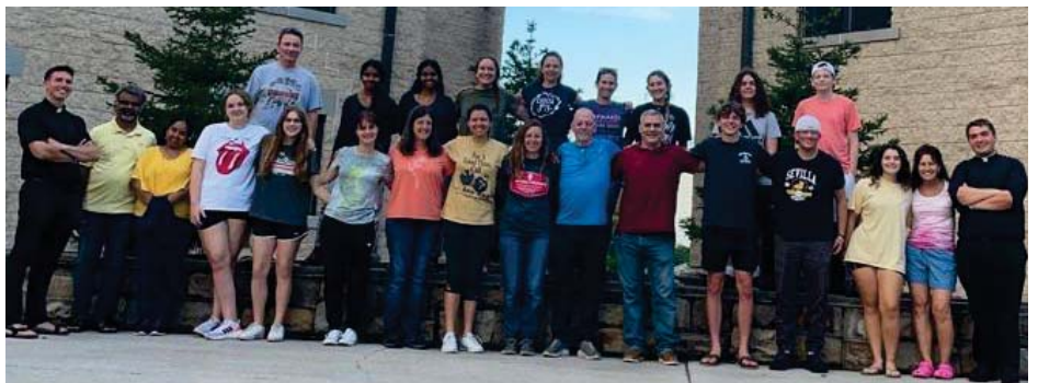
The Epiphany of the lord