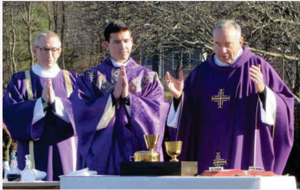
Photos from last weekends 133rd consecutive outdoor Mass.