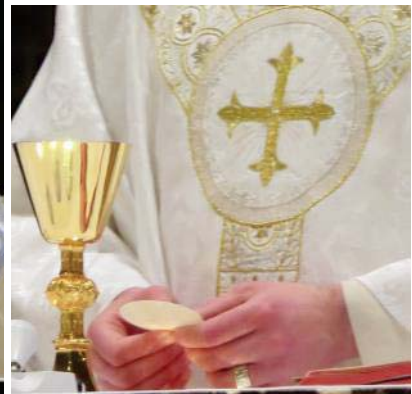
137th Consecutive outdoor weekend Mass January 1, 2023