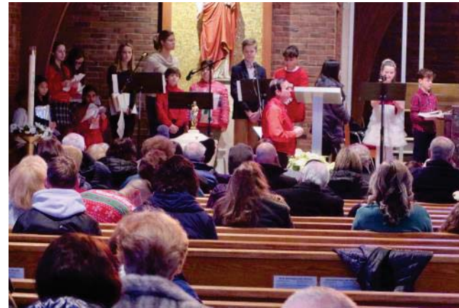
Photos of indoor Masses December 31/January 1 Weekend.