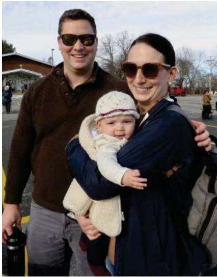
January 1 outdoor Mass.