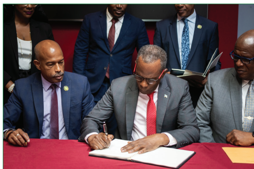
(l-r) Mr. Rodinald Soomer , CEO CARICOM Development Fund, Prime Minister Pierre and Senior Minister for Infrastructure, Hon. Stephenson King

The Government of Saint Lucia has signed two significant financing agreements with the CARICOM Development Fund (CDF) to support national water infrastructure and expand access to clean, reliable water.