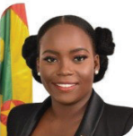
Hon. Kerryne James Minister of Climate Resilience, the Environment, and Renewable Energy, Government of Grenada