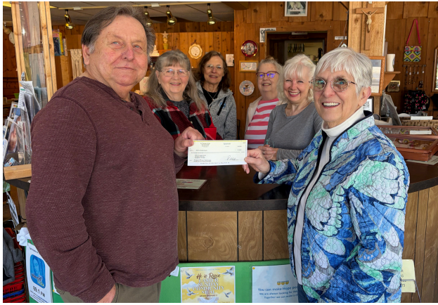
St. Theresa thrift store volunteers present Three Lakes Meals on Wheels (above), Sunshine for Humanity (right), and the Salvation Army (below) with monies obtained through sales by the dedicated crew of committed volunteers!!! Thank you for doing God's work in this ministry helping others!!!