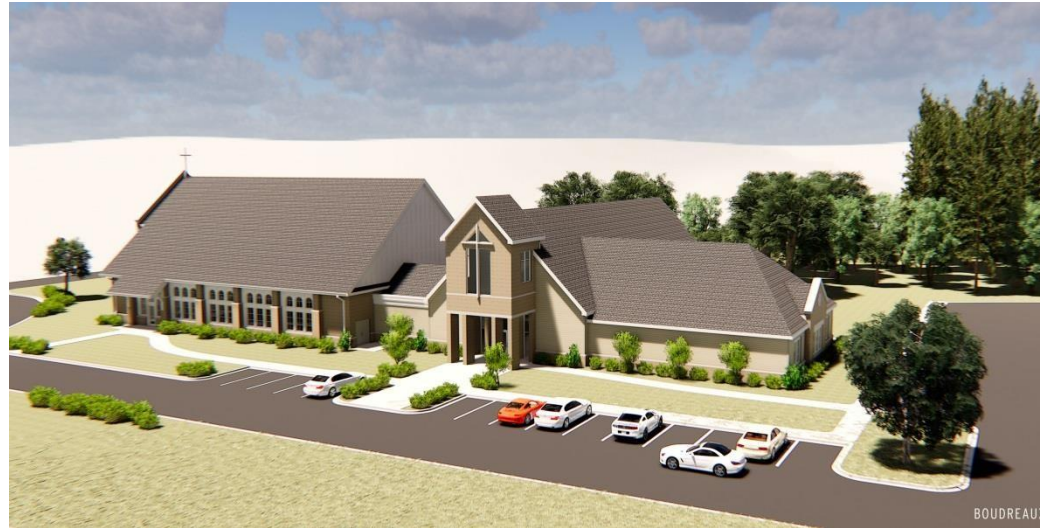
East Side Project B-1