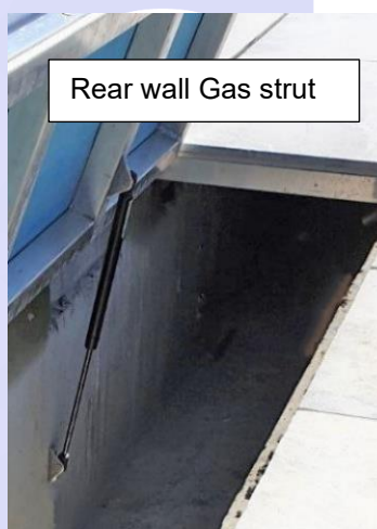
Rear wall Gas strut