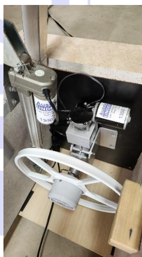
Acuators on additional cross braces