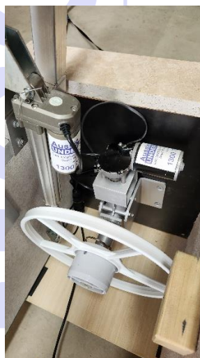
Acuators on additional cross braces