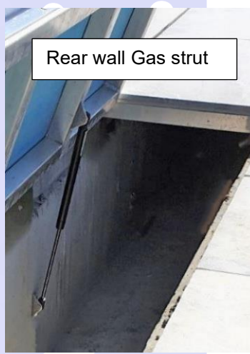
Rear wall Gas strut