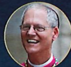
Mass with Archbishop Etienne