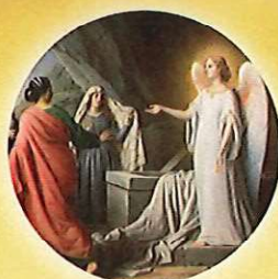
Solemnity of Easter 4/5