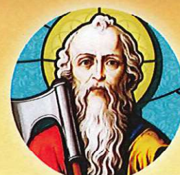
Feast of Saint Matthias 5/14