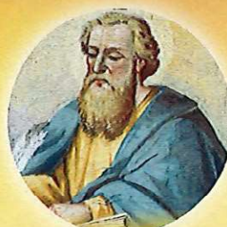
Feast of Saint Mark 4/25