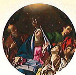
Solemnity of Pentecost 5/24

As Catholics, we celebrate the Easter Season from Easter Sunday through Pentecost. This year, the Easter Season is marked by three solemnities and two feasts. We also observe the month of Mary in May. Learn more about these great feasts and ways to celebrate all Easter season at archseattle.org/easter .