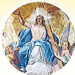
Solemnity of the Ascension 5/17